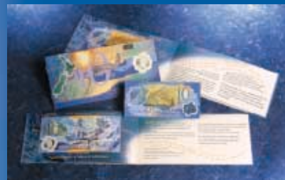
Product 2 - $19.00